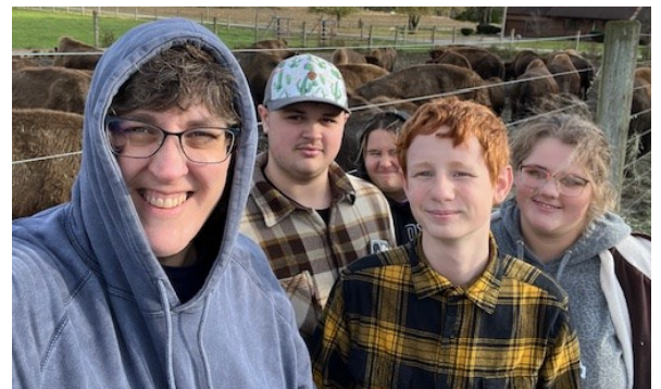
Our favorite tour during National FFA Convention was at Broken Wagon Bison Farm in Hobart, IN.