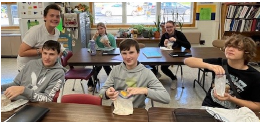
First quarter students in the Ag, Leadership, & U (Ag 8) class enjoy home-made ice cream on their last day of class.