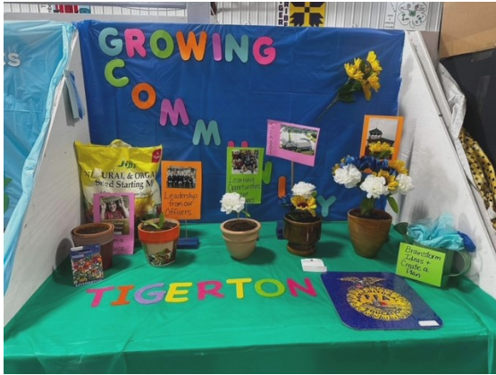
The FFA Fair Booth won a blue ribbon @ the Shawano County Fair.