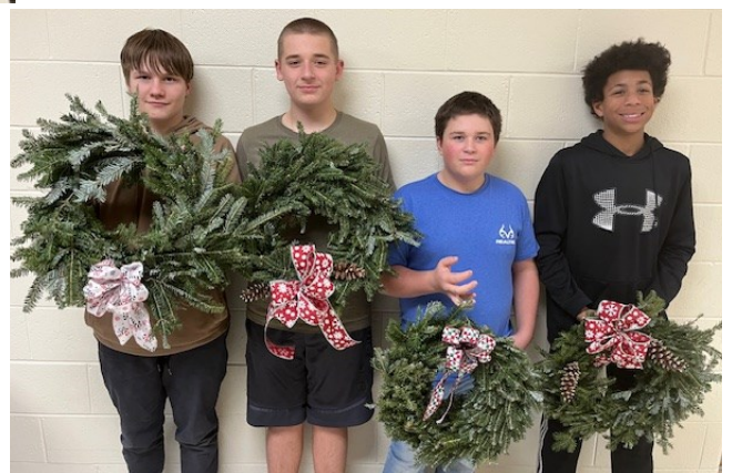
On the right, students in the second quarter Ag, Leadership, & U (Ag 8) class show off the holiday evergreen wreathes they made for their families for the holiday season.

The Ag Department is in need of ice cream pails in good condition. Please drop them off at the high school office.