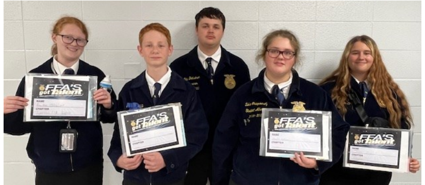
Part of the Officer team at Section 8 Fall Leadership Workshop in Seymour.