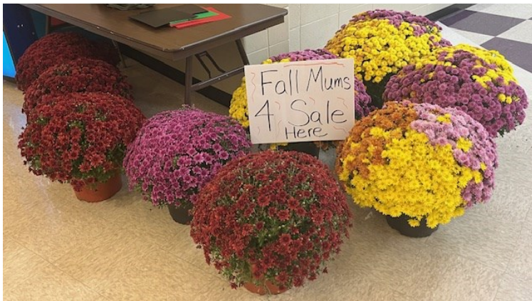
110 fall mums were sold to raise money to send four FFA officers and advisor to 2023 National FFA Convention in Indy.