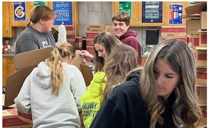
Food Science students assemble and sort the 160+ Nueske's meat boxes sold by the Tigerton FFA Alumni & supporters for their recent fundraiser.