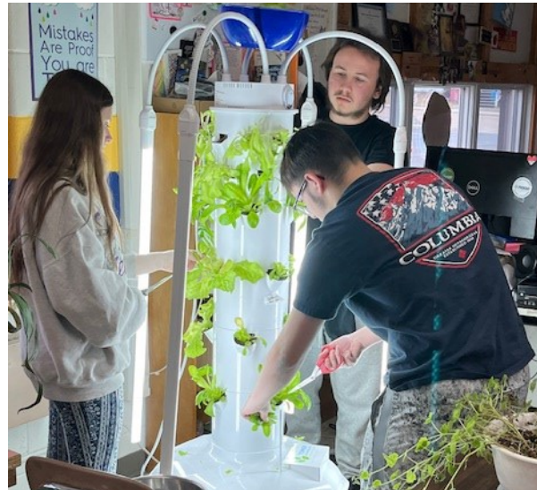
Students in the Ag Productions (SE) class recently harvested the first crop of lettuce grown in the Tower Garden Grow System and donated it to the school lunch program.